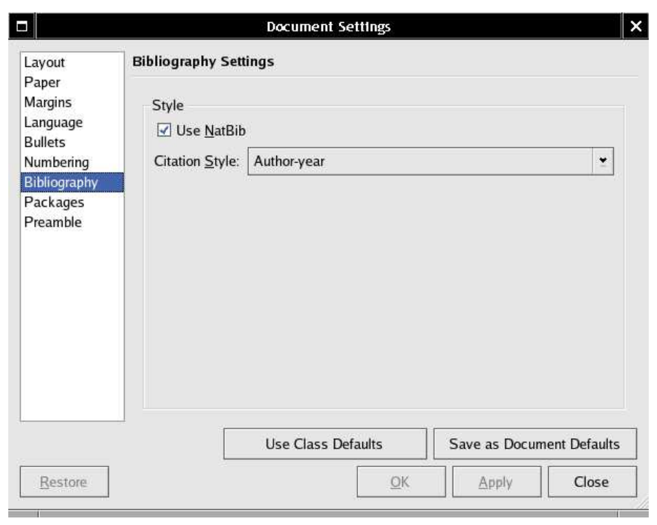
Figure 2: Document/Bibliography Dialogue